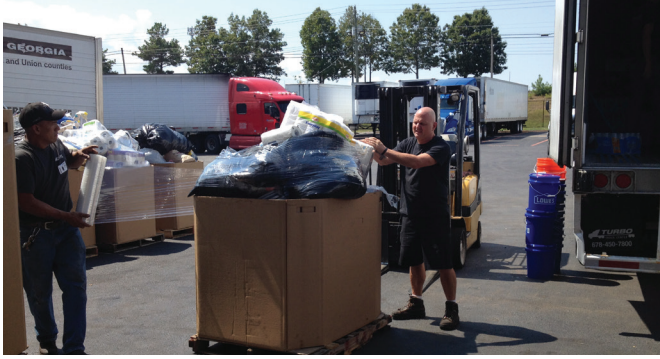
Turbo Truck Center employees sorted and boxed donations for Louisiana flood victims.