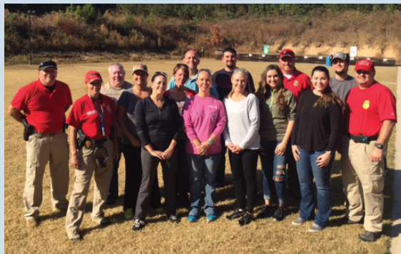
Twelve Syfan team members took part in the gun safety class.

The active shooter training program is called CRASE (Civilian Response to Active Shooter Events) and consisted of two classes – the first for management and the second for all team members. The program coincides with law enforcement’s training and curriculum for active shooters and has been designated by the FBI as the national standard for active shooter response training. The goal is to get law enforcement agencies and civilians to follow the same procedures during an active shooting workplace situation. CRASE